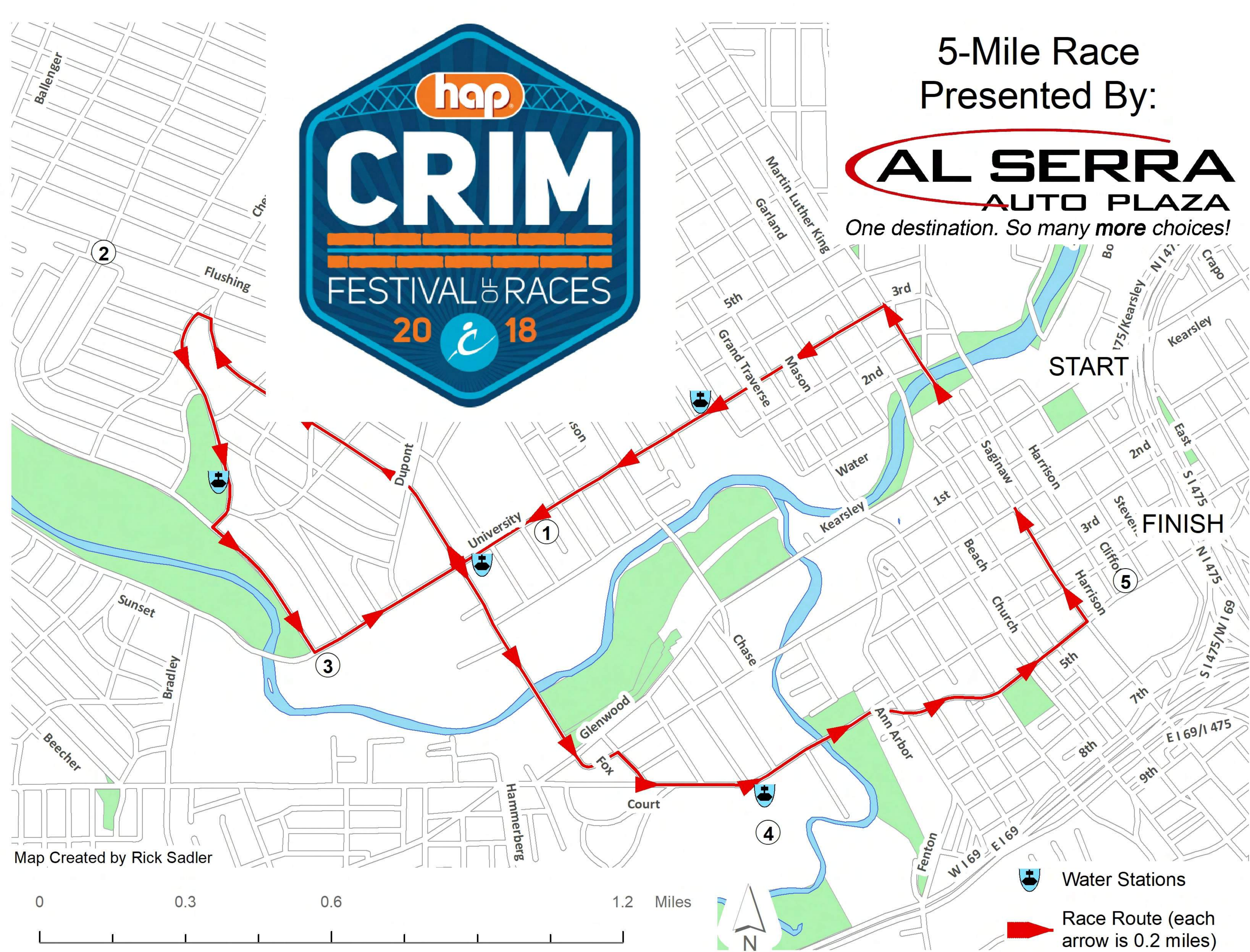
Map Created by Rick Sadler